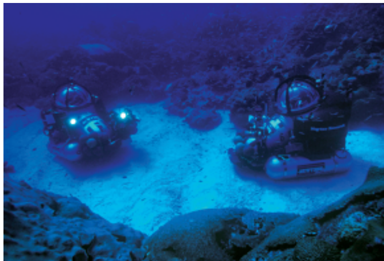
UNDERWATER EXPLORATION. Deep Worker submersibles explore the Flower Garden Banks National Marine Sanctuary in the Gulf of Mexico.