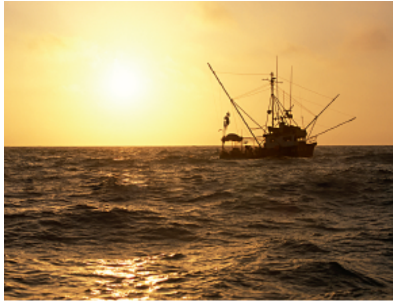
THE DAY'S CATCH. A commercial fishing vessel off the coast of Santa Cruz, California returns to port.