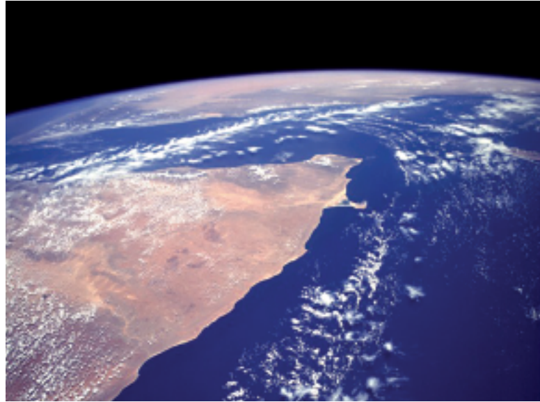
THE OCEAN FROM SPACE. Photograph from NASA's Columbia Orbiter Vehicle shows Somalia in center, South Yemen and the Gulf of Aden toward the top and the Indian Ocean to the right.