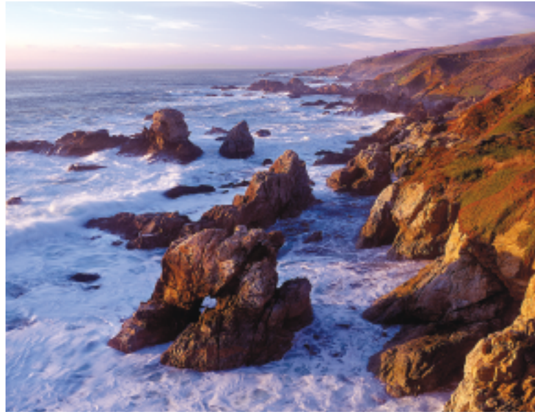
COASTAL CARVINGS. The Big Sur coastline in California is the result of a great geological uplifting, which occurred roughly 30 million years ago.