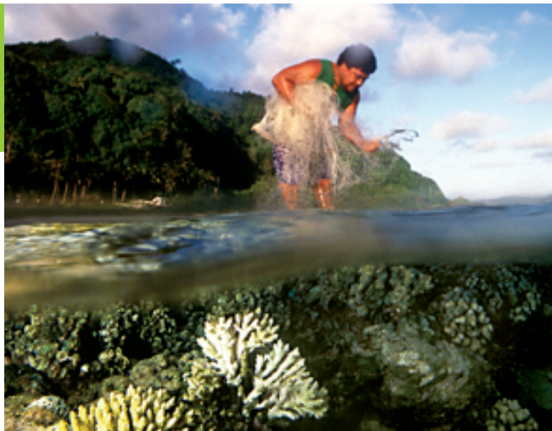
CORAL REEF HABITAT. A fisherman tries his luck with a simple net in American Samoa.