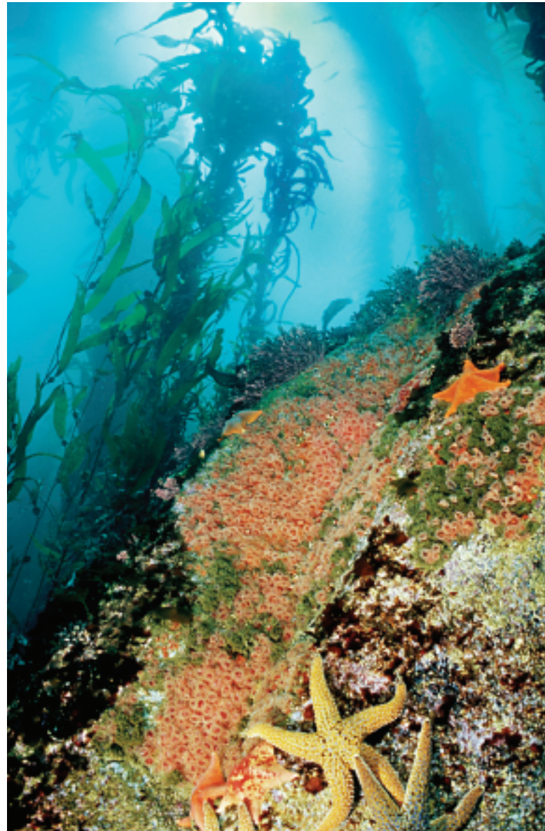
PACIFIC ECOSYSTEM. An ochre sea star makes a kelp forest home in Monterey Bay, California.