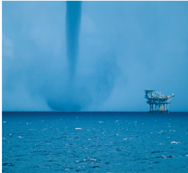
NATURAL PHENOMENON. A rotating column of air (similar to a tornado) creates this water spout in the Gulf of Mexico near an offshore oil rig.